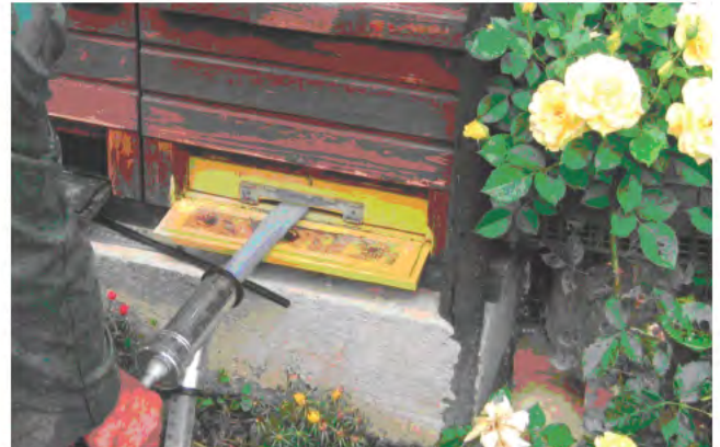
Photos 1 – 4. Using a special instrument “top”, which under compression produces aerosol, for application of treating dose of sugar syrup with Nozevit.